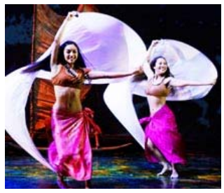
"Ulalena" showcases Hawaiian legends and history through dance and music.

Maui may not boast the big-city lights of more cosmopolitan vacation spots, but its distinctive performing arts scene is so well-suited to the island that it deserves a rousing round of applause. From its impressive arts and cultural center and compelling annual events to live productions and varied nightlife scenes, Maui's entertainment mix matches the destination to perfection.